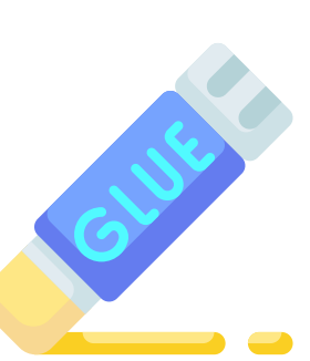
4 Big Glue Sticks