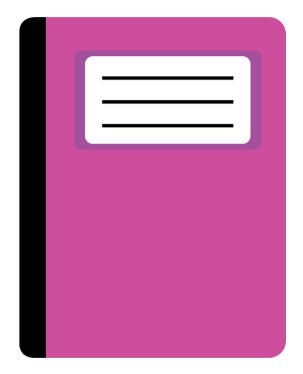
1 Composition Notebook