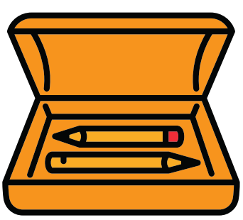
1 Pencil/Supply Box (Non Locking)