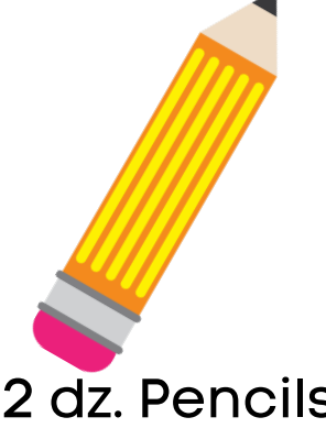
2 dz. Pencils (Ticonderoga)