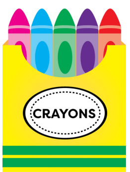
2 - Boxes of Crayons (24ct. Crayola)