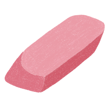
2 Large Pink Erasers