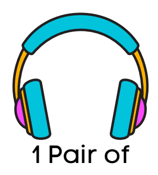
1 Pair of Headphones